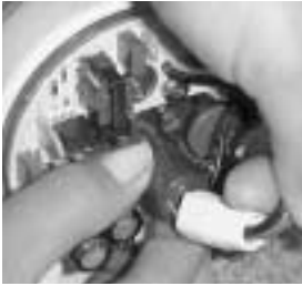
Figure 23 (Internal Power Supply) Removal of Single Socket lamp Connection